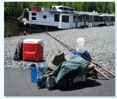
Don't forget your fishing pole!